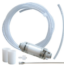
Measuring hose set (Individual parts)

All individual parts are already included in the scope of delivery of the ORBmax.