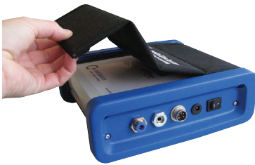
Practical protective cover included